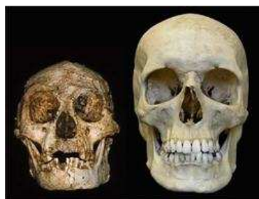
The skull of Homo floresiensis is tiny compared to modern day Homo sapiens .

Students will understand the virtues - and problems - of measurement or correlational studies, "true" experiments, and the "quasi"-experiments (or field studies) often used in Psychology. Students will also be introduced to statistical reasoning in science, and to basic statistics.